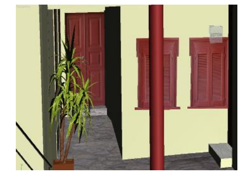
Figure 5: Perspective views of a 3D model building represented at the forth LOD, in 3D Studio Max

After the reconstruction of 3D building models, their attributes were imported in the database and linked to useful external files. Since the contents of the 3D GIS are common to the ones of the 2D GIS, the procedures performed to establish the two-dimensional system formed the basis for the three-dimensional one. Specifically, the common data was imported to the three-dimensional system by joining the tables of entities between the two systems.