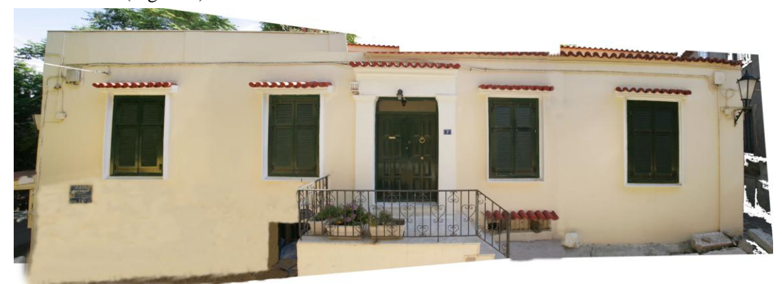
Figure 4: Photomosaic of a building's façade after editing.

were carried out on individual photos using the rectification software Archis so that a photomosaic could be generated. Furthermore, by using the Photoshop CS3 software the noise and obstacles appearing in the photos were removed (Figure 4).