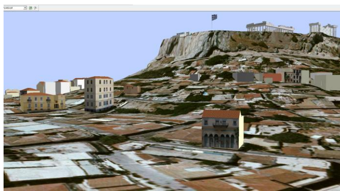
Figure 2: Left: Creation of the 3D background which resulted from a draping process. Right: Representation of buildings at the first level of detail (LoD).

The first and lowest level of detail consists of the two-dimensional depiction of the buildings. This level in which there is no concept of altitude, meaning the volume of the building, shows the outlines of buildings as seen on topographic maps or ground plans (Figure 2 right). The depiction of the buildings at this level is the basis for the three-dimensional representations.