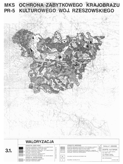
Figure 1: Example of the source materials – the scanned analog map

The main problem during the realization of the project was the analog source material, which needed proper processing. Scanned maps of provinces with the outlines of architectural and landscape units, as on Figure 1, were of very low quality and were geometrically distorted. For this reason each map sheet required suitable transformation [1].