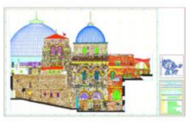
Figure 3: A sample of the vertical crossections – South facade

All photogrammetric stereopairs were oriented and plotted either on a Leica DVP digital stereoplotter, or an Adam MPS-2 analytical stereoplotter. The three dimensional photogrammetric outputs were later processed by the team of architects, in order to produce the final drawings (Figure 3).