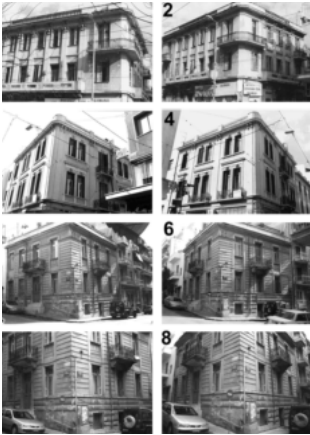
Figure 1. The images of the first test.

larged prints had been somewhat cropped, the interest focused here not on the actual values of interior orientation but rather on the closeness of results from the three calibration approaches (it is noted that the images were scanned in different resolutions).