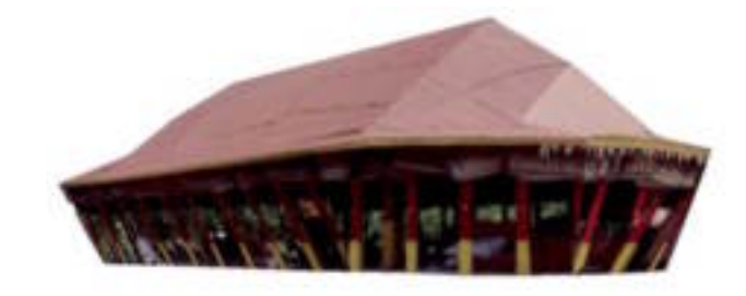
Fig.9: Photomodel of the Fale

To start with the definition of a local coordinate system by using shapes (x-y - plane, z - axis) with many points. After that a sub block should be adjusted sharing points of the definition of the coordinate system. To adjust the entire block a consecutive adjustment is advised always adding one or two further neighbouring pictures into the adjustment.