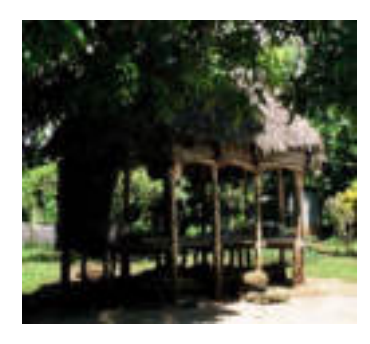
Fig.4: Fale o'o

At first the architects concentrated on the different types of Fale. The simplest form is the Fale o'o.