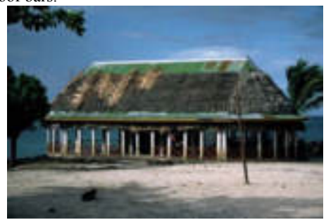
Fig.5: Fale āfolau

beams. Another representative elements are the carvings on the centre roof bars.