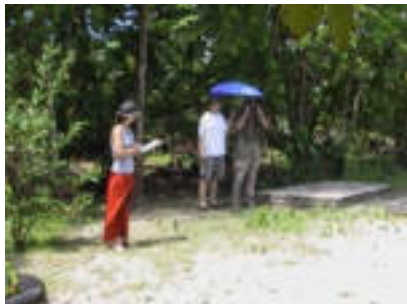
Fig.8: Taking pictures

Other aggravating circumstances were the heat, tropical rain showers and the narcotising effect of the welcome drink "Cava". Some missing pictures and large picture scale now and than resulted of the unusual conditions. But within the progress of the journey and with some routine the recording results improved.