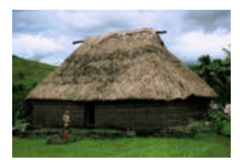
Fig.2: Mbure, Fiji

The wooden skeleton structure that build the base for buildings on both islands show high skills in handy craft and a good knowledge about materials. But these traditions are declining. The hot and damp climate limits the durability of the buildings to approximately 20 years. Steady and complex renovation work extends the life span of the fragile architecture. But the number of people who can afford costly and work intensive procedure is inclining steadily. As there is no direct need, also the knowledge about the building process, the static features and the handy craft is sinking into oblivion.