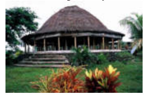
Fig.1: Fale Tele, Samoa

The indigenous architecture of Samoa and Fiji are showing house forms, which are unique in their structure and form worldwide. The separate construction types differ not only in their form and size, but also by independent construction ways. Valid principles of architecture can generally be derived from the typological sequence of the simple wall-column structures about the complex frame construction up to high-complicated suspended constructions, which contribute to an extended understanding of the architectural development and the interrelations between building and society.