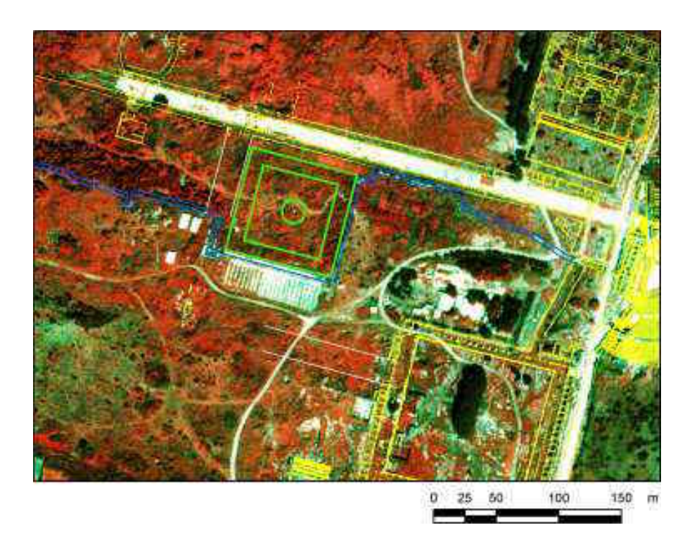
Figure 3: Aerial photo with interpretation (green)