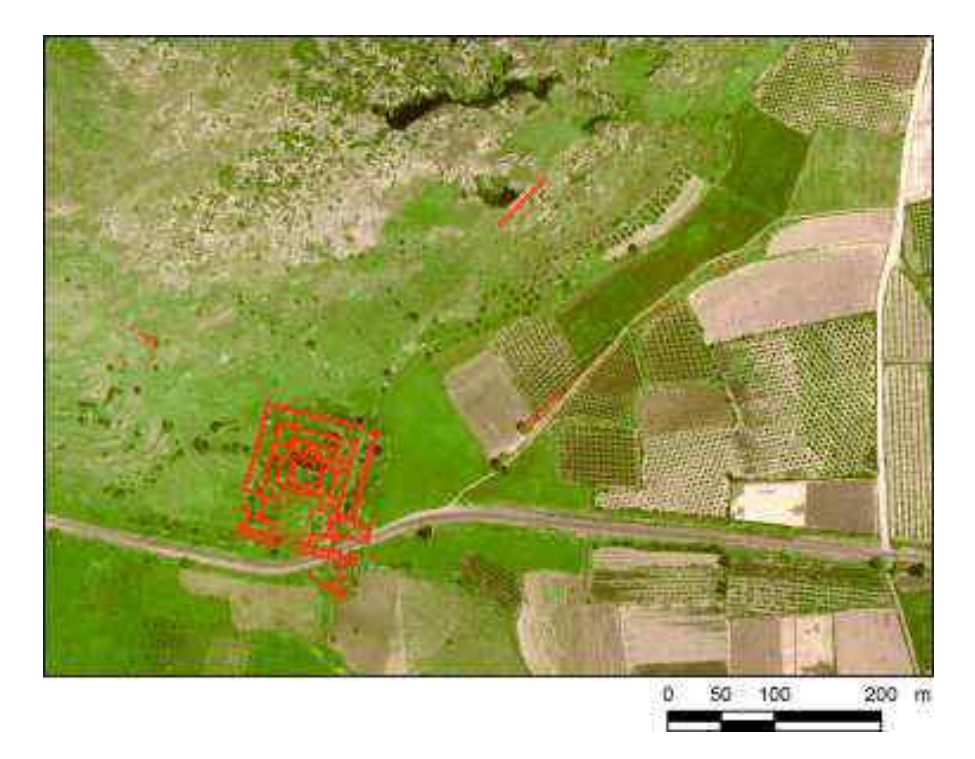
Figure 2: Generalised city map and orthophoto in natural colouration