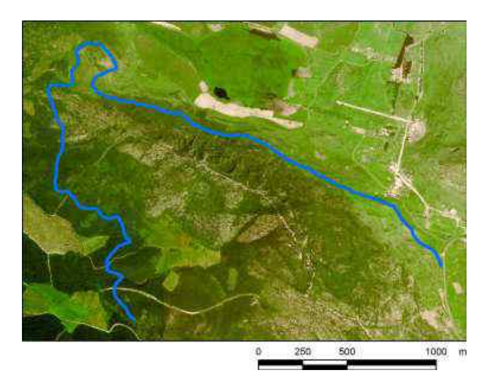
Figure 4: Calculated run of the water conduit