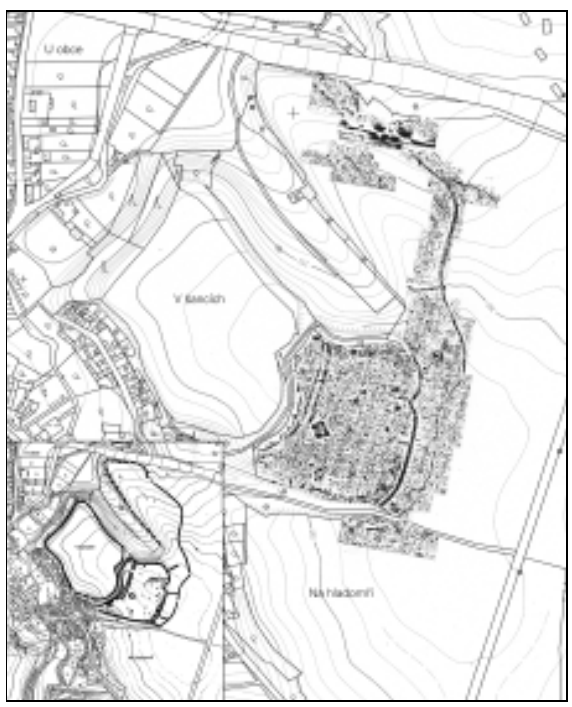
Figure 2. Large area magnetometric survey of hillfort Přistoupim (11 ha).

ploughed out prehistoric and Early medieval hillforts near Vepřek and Bosyně, both in district Mělník. The example of results of systematic magnetometric survey (approx. 2,5 ha) of Early medieval/Iron age hillfort near Bosyně (Křivánek 2003) we can use as for separation of the whole fortified site as for identification of different subsurface archaeological situations (fig. 1). Magnetometric survey on very long and narrow headland separate different transverse systems of fortification (outer single ditch, inner ploughed out main fortification system ditch-rampart-ditch) and also very probable entrance to the hillfort. Inside of fortified area were then identified groups with larger subrectangular sunken settlement features approx. 5x3 m (probable houses), smaller sunken features (probable pits) and relics of line of ploughed out probable perimeter fortification.