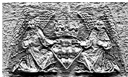
Figure 5. One of the rectified ornament belonging to the main facade. Up: original image; Down: filtered image