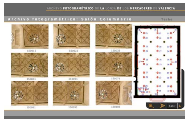
Figure 7. Stereo-partners of the Salón Columnario ’s ceiling together with a magnified sketch

Detalles (details): In this section the rectified images can be seen. They are also accompanied with some sketches (see figure 8).