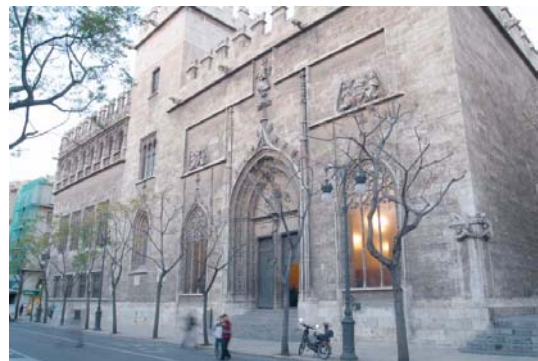
Figure 1. Main facade of la Lonja

La Lonja is made up of three different parts plus a garden (see figure 6) called Patio de los Naranjos (Orange Trees’ Patio).