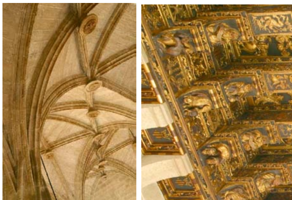
Figure 2. Left: oblique perspective of the Salón Columnario ceiling; Right: detail of the Salón del Consulado del Mar ceiling

where a wonderful wooden ceiling can be appreciated (see figure 2 right); and the Cambra (Chamber) on the second floor.