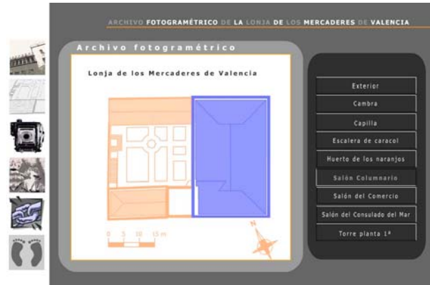
Figure 6. Choosing one of the building’s rooms by means of an interactive ground plan of la Lonja

Archivo fotogramétrico (photogrammetric archive): Here all the stereo-partners, normal and oblique photographs are shown. They are perfectly distributed according to which part of the building they illustrate and are accompanied with their labelling numbers, some sketches and a brief legend. The user can access the whole set of images by means of successive interactive ground plans of the building (see figures 6 and 7).