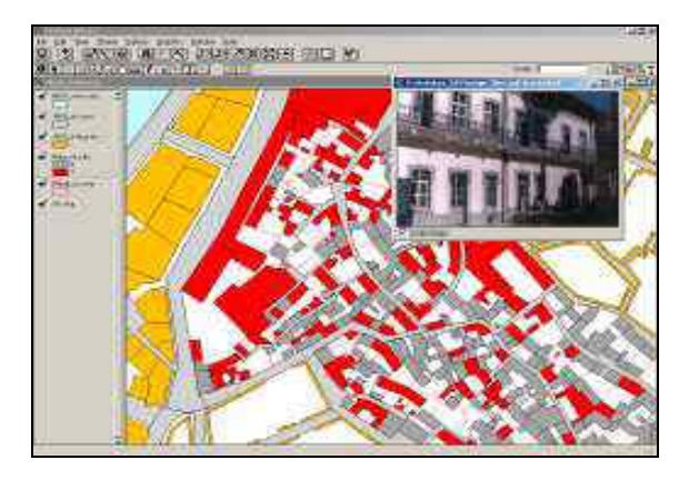
Figure 3. Attachment of JPG files

Other visual data such as old and new photographs from the city and Zenginler District as well as engravings produced by the travellers have been scanned and converted into JPG files. They are attached to the related spatial objects using the hyperlinking property of GIS. Thus, by clicking onto related map feature, the linked visual data could be visualized as well. (Figure 3)