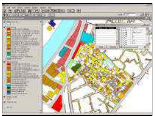
Figure 6. Example from the queried results

In the framework of input data, various queries over designed database have provided juxtaposition and superimpose of different spatial layers during evaluation of the analyses.