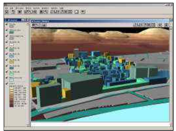
Figure 5. 3D Model of the site

While producing overlay of visual documents onto the designed base map and database, 3D model of the topography and the study area is constructed so as to evaluate the silhouette of the context.(Figure 5)