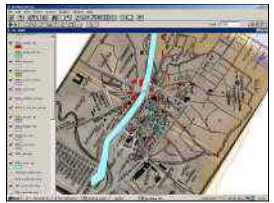
Figure 4. Overlay of historical maps

In order to evaluate the historical continuity of the Zenginler District a comprehensive understanding of the historical development of Antakya should be achieved. Therefore, to visualize the expansions or reductions of the city throughout history and to compare the changes, a set of overlay is prepared showing the layout of the city from different eras including Hellenistic, Roman, Byzantine, Arabian and Ottoman eras and existing situation. (Figure 4)