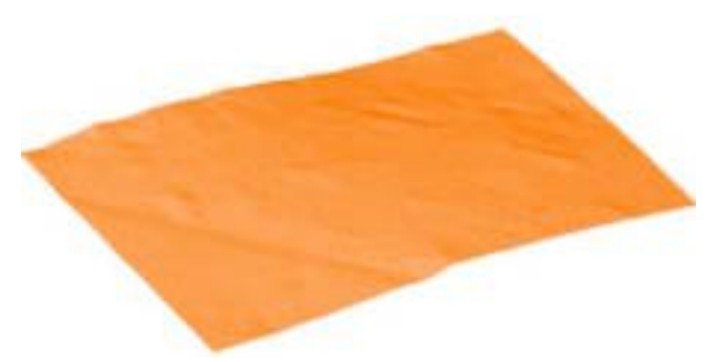
Figure 2. DTM of the Fatih Mosque surrounding

The 3D model of Fatih Mosque and surroundings was generated in two steps. First the 3D model of the Fatih Mosque was generated, from 2.5D photogrammetric map and 3D digital vector plotting of Fatih Mosque. Then the 3D model of surrounding was generated from 2.5D photogrammetric maps. Digital terrain model (DTM) of the surrounding was generated by using the 2.5D form photogrammetric map points, which is belonging to the ground as lattice. (Figure 2).