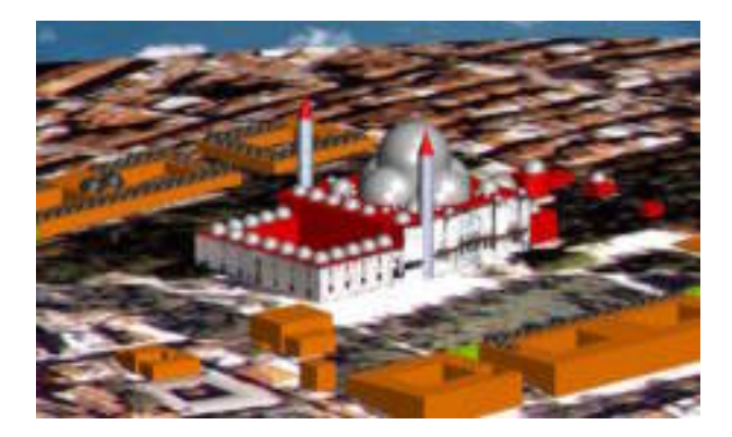
Figure 7. 3D model of Fatih Mosque and surrounding place