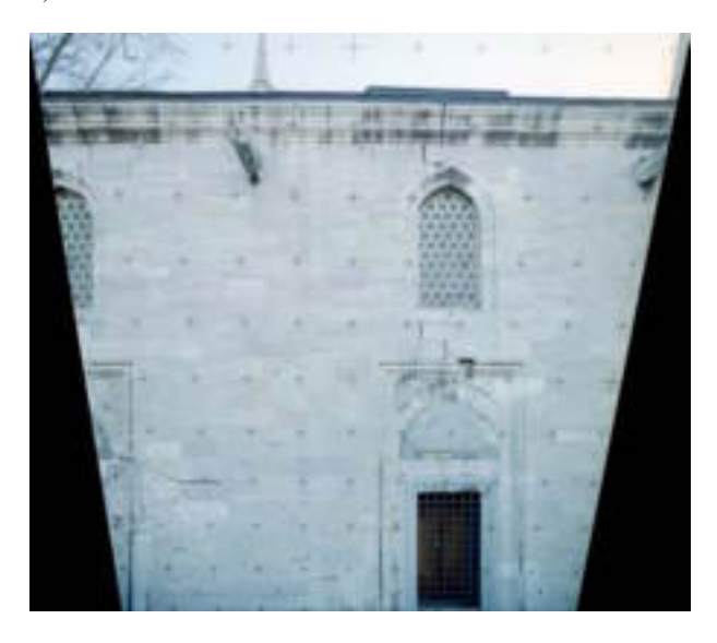
Figure 1. Differentially rectified image

operator after generation of stereo models. MicroStation (Bentley) software was used for 3D vector plotting of Fatih Mosque facades as CAD software. These works were done for the Fatih Mosque documentation project and also used for this study. For each facade, differentially rectified images are generated and registered to ground coordinate system. (Figure 1)