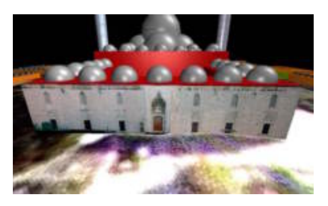
Figure 6. Northwest side of Fatih Mosque 3D model