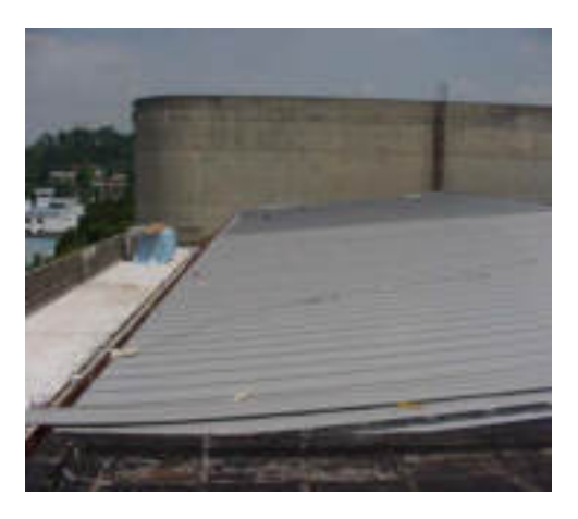
Figure 11: Completed new roof finishes