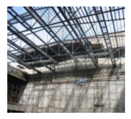
Figure 10: New roof trusses installation

The entire pitched roof over the great hall was replaced with new steel frame and water-proof roof membrane). The design basically reflected the original design with several improvements in terms of acoustic, structural strength and quality (Refer to Figure 10 & Figure 11).