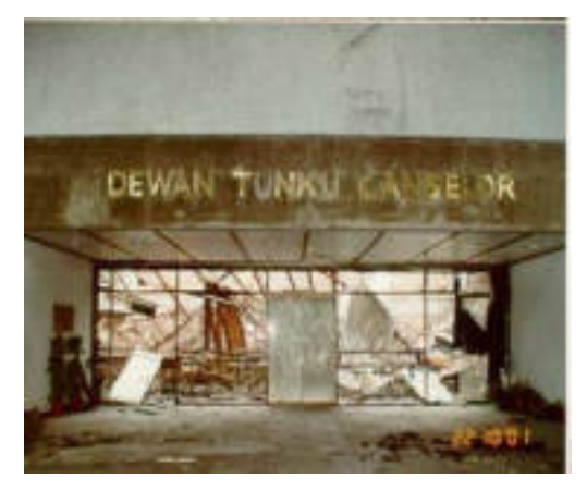
Figure 3: View from the main foyer.