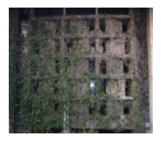
Figure 5: The spontaneous plants on the building facade