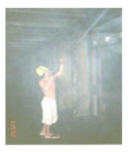
Figure 8: Water jetting

and foyer areas. The second part of cleaning was applied, using scrappers, sponge and a metal hard brush, by scrubbing it manually. Very little Liquid Organic Cleaner (LOC) was used to enhance the process (See Figure 9).