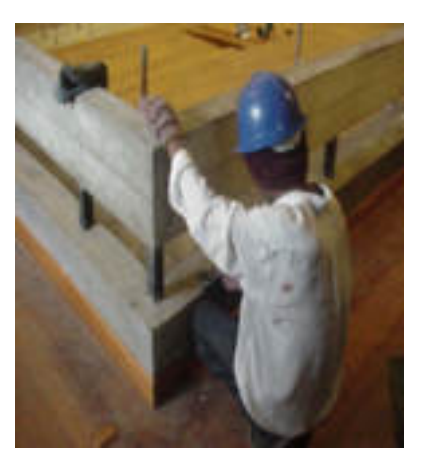
Figure 13: Refining the existing concrete handrails.

The Interior Design Work was based on the new requirements for new services systems and facilities in order to ensure that