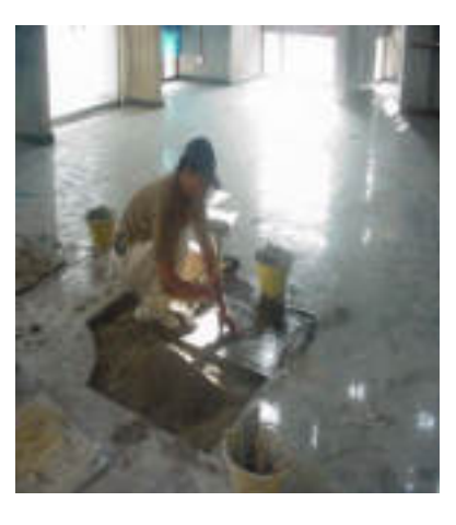
Figure 12: Replacing the broken granite floors.

The important architectural features in DTC were retained and the original design maintained. The main foyer area, the granite flooring, facades and slab soffits, the services and mezzanine level, spiral staircases and concrete handrails were retained (See Figure 12 and Figure 13).