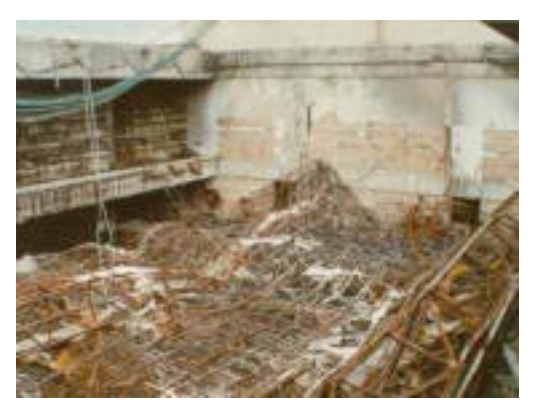
Figure 2: Collapsed roof trusses into the Great Hall

On Friday, June 29<sup>th</sup>, 2001, a pre-dawn fire gutted the building. Since then DTC had restricted entrance to the public. Almost 90% of the entire internal building was destroyed by fire and fire fighting efforts (See to Figure 2 & Figure 3).