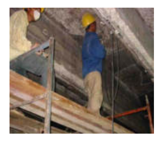
Figure 6: Hacking of the damaged concrete surfaces.

After hacking and repairing the steel reinforcement bar of the concrete and beams (refer to Figure 6), a few layers of bonding agent called 'Nittobond EP' were placed to cover the exposed structure (refer to Figure 7). Then the formwork was prepared from layers of timbers line up to produce a textured surface as to its original design. The 'Renderoc LA Concrete' was filled up and hardened until the required strength about 60KN was achieved. Once concrete hardening, formworks were removed and surfaces were refined.