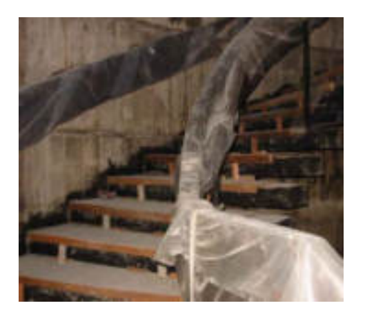
Figure 4: Temporary protection for the spiral staircase

) provide temporary protection on the site to ensure that the existing building elements and spontaneous plants were not further damaged during construction. (See Figure 4 & 5)