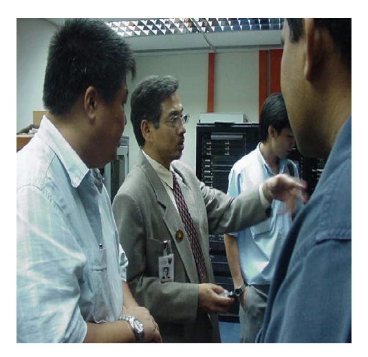
Figure 18: The top management's site visit

Conducting weekly technical meetings and biweekly consultants and contractors meetings on-site throughout the project were very important in order to keep track of the work schedules and to solve technical problems on site. Record and documentation approach was implemented in this project to monitor the work in progress. Documentation was properly done before, during and after it was completed in order to record the entire construction process for future references.