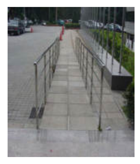
Figure 15: Additional accessible ramp for the disable.

For the foyer area, the main features were retained with minor intervention of the areas. Improving and repairing works were done including replacing damaged timber framed and broken glass windows and doors, new M&E system with fire protection facilities (sprinklers), repairing the concrete wall finishes and adding new features for exhibition proposes. At the exterior part of the building, upgrading the facilities for disabled and pavements layouts and a new landscaping was designed to complement the building (See Figure 15).