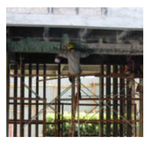
Figure 7: Applying layers of bonding agent Nittobond EP'

Ninety percent of the existing concrete elements surfaces were covered with soot mark and they required to be cleaned. Appropriate methods of cleaning were used. At the beginning, water jetting system was used to the entire surfaces (See Figure 8). It was found that the soot mark were embedded into the surfaces and difficult to remove especially at certain elements and remote area such as concrete fins, slab soffits, staircases