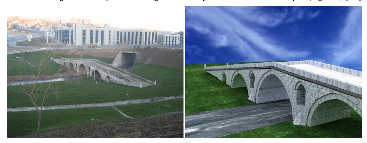
Figure 2: Examples of the Bridge, and the Generated Model

Kapuağası Bridge, which was built by Architect Sinan in 16 century, was studied as an MSc design project in 2006. In this study, digital terrestrial photogrammetry technique is applied for the documentation of a historic bridge from the images. Also, building surveys are produced on various scales as a result of photogrammetric evaluations and three-dimensional modelling of the monument, videos in a variety of resolutions of bridge model are produced using virtual reality and visualization techniques (Figure 2) [4,5].