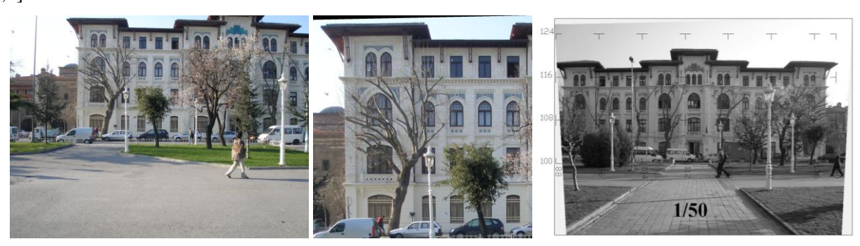
Figure 3: Examples of Building's Front Facade and Ortho-Rectified Images

In the scope of completed MSc design project in 2007, capability of mobile phone cameras for producing building survey was investigated. Single image photogrammetry methods and ortho-rectification technique were used. For this purpose images of the building's front facade were obtained with both mobile phone camera and a digital camera and images were ortho-rectified. Afterwards, obtained two different sets of data compared for the accuracy analyses (Figure 3) and results were given in Aydar, 2007 and Aydar et al, 2007 [6,7].