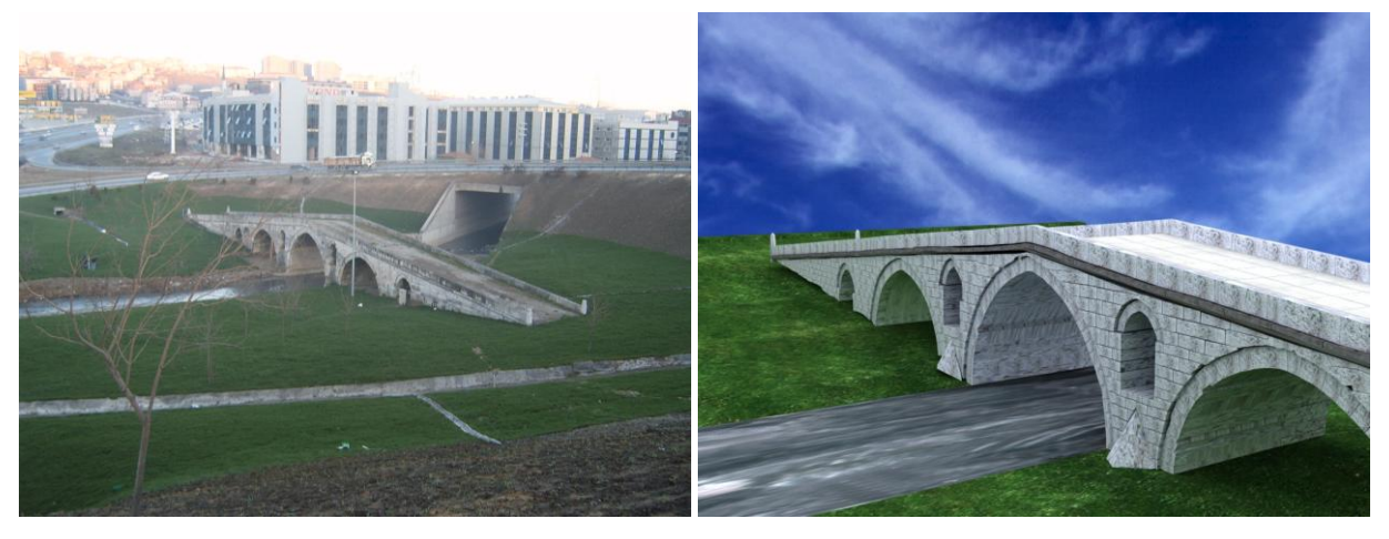
Figure 1: Results from Term Project Examples

Students are expected to deliver and present their project with at least graph data. Additional data and models production can be realized depends on their own interests and skills. Students are free to choose the software package for the evaluation procedures. Depending on the chosen software the basic user manuals are supplied during the course. Some examples of models produced by the students in the last semester are given in Figure 1.