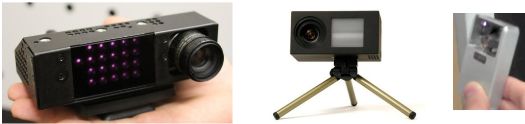
Figure 1: Some models of ToF cameras by Canesta Inc.: Canesta XZ422, Canesta DP200 and Canesta Cobra (from left to right).

Canesta Inc. [9] provides several models of depth vision sensors differing for pixel resolution, measurement distance, frame rate and field of view. Canesta Inc. distributes sensors with field of view ranging between 30° and 114°, depending on the nature of the application. Currently, the maximum resolution of Canesta sensor is 320 pixel x 200 pixel (Canesta “Cobra” camera), one of the highest worldwide. Some cameras from Canesta Inc. can also operate under strong sunlight conditions using Canesta’s Sunshield™ technology: the pixel has the ability to substantially cancel the effect of ambient light at the expense of producing a slightly higher noise. In Figure 1 some images of ToF cameras produced by Canesta are reported.