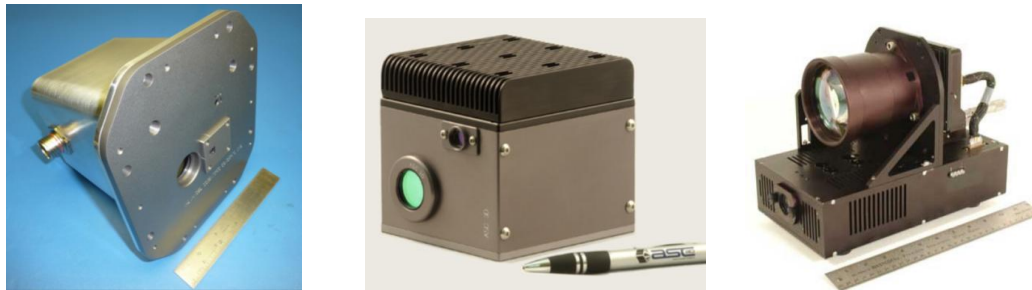
Figure 4: Some ToF cameras by Advanced Scientific Concepts Inc.: Dragoneye 3D Flash LiDAR, Tigereye 3D Flash LiDAR and Portable 3D Flash LiDAR (from left to right).

The manufacturers providing commercial ToF cameras based on the direct Time of Flight measurement are only a few. Advanced Scientific Concepts Inc. produces several models of ToF cameras based on the direct Time of Flight measurement [12] (Figure 4). Data acquisition is performed with frame rates up to 44 fps, with optics field of view up to 45°. The proposed technology can be used in full sunlight or the darkness of night. Nevertheless, the sensor resolution is limited to 128 pixel x 128 pixel. Major applications of these cameras are airborne reconnaissance and mapping, space vehicle navigation, automotive, surveillance and military purposes. The great advantage of this technology is the high working range: measurements up to 1500 m are possible.