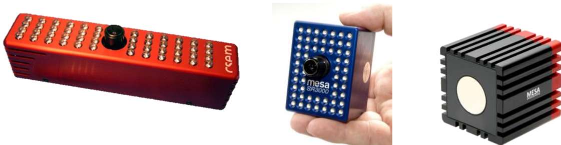
Figure 2: Some models of ToF cameras by MESA Imaging AG: SR-2, SR-3000 and SR-4000 (from left to right).

MESA Imaging AG [10] has developed the SwissRanger (SR) ToF camera series: SR-2, SR-3000 and SR-4000. Working ranges up to 10 m are possible with ToF cameras by Mesa, while the sensor resolution is limited to 176 pixel x 144 pixel (SR-3000 and SR-4000 cameras). MESA Imaging AG distributes sensors with field of view ranging between 43° and 69°, depending on the selected optics. Simultaneous multi-camera measurements with up to three devices are possible by selecting three different modulation frequencies. In Figure 2 some images of ToF cameras produced by Mesa are showed.