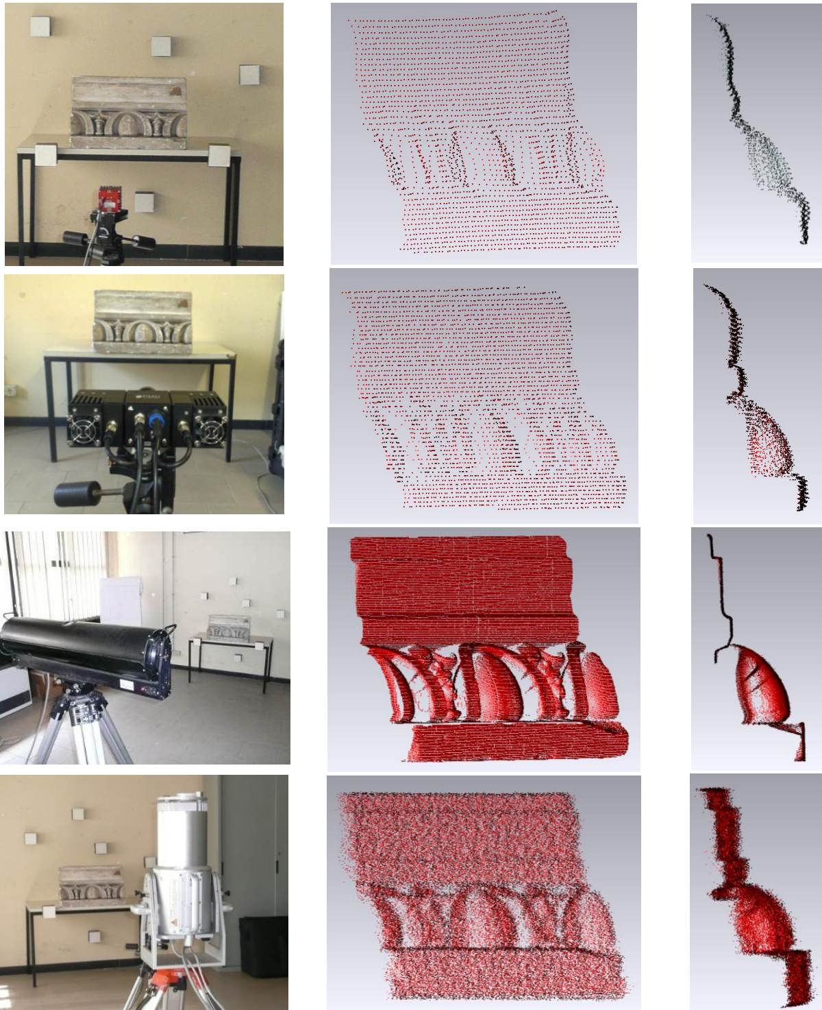
Figure 5: Data acquisition and 3D views of: the SR-4000 point cloud after frame averaging, distance correction and mixed pixel removal (first row), the PMDCamCube3.0 point cloud after frame averaging and mixed pixel removal (second row), the Mensi point cloud after manual filtering (third row) and the Riegl LMS-Z420 point cloud after filtering with the RiSCAN PRO software (forth row).