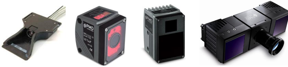
Figure 3: Some ToF cameras by PMD Technologies GmbH: PMDA2, PMDO3, PMDS3 and PMDCamCube3.0 cameras (from left to right).

The manufacturers providing commercial ToF cameras based on the direct Time of Flight measurement are only a few. Advanced Scientific Concepts Inc. produces several models of ToF cameras based on the direct Time of Flight measurement [12] (Figure 4). Data acquisition is performed with frame rates up to 44 fps, with optics field of view up to 45°. The proposed technology can be used in full sunlight or the darkness of night. Nevertheless, the sensor resolution is limited to 128 pixel x 128 pixel. Major applications of these cameras are airborne reconnaissance and mapping, space vehicle navigation, automotive, surveillance and military purposes. The great advantage of this technology is the high working range: measurements up to 1500 m are possible.