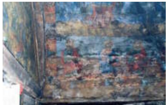
Detail of the Nave's vault