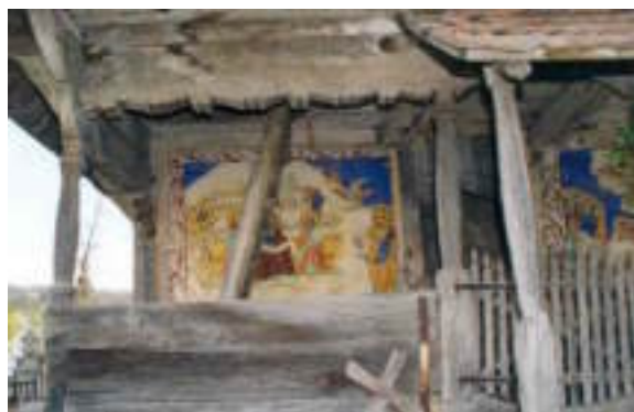
The porch - detail