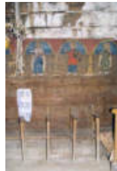
Nave – detail