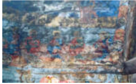
Detail of the Altar's vault