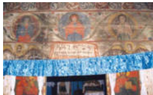
Iconostasis – detail

The wooden church “ Saint Nicholas”, Lelești commune, Lelești village. It was erected in 1774, the monument was remade, partially and painted again in 1847, and then again in 1932 and 1957 there were made some interventions. The conservation status of the interior painting is poor, partially, and mediocre in the rest.