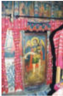
Iconostasis – detail