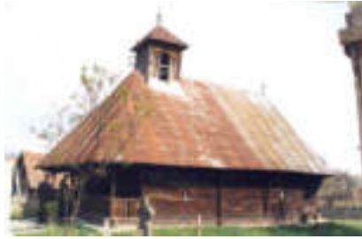
The exterior – The Peștișani Church