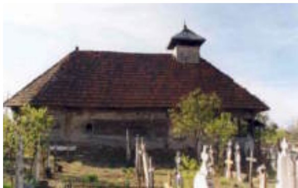
The exterior – The Frățești Church