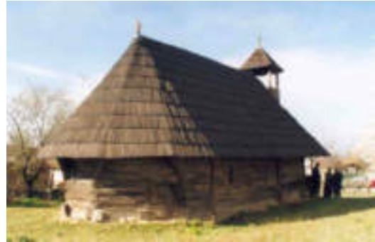
The exterior – The Lelești Church