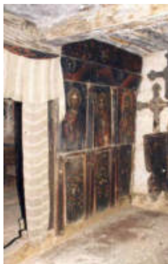
Narthex – detail – East wall