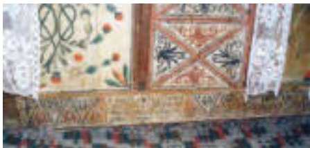
Iconostasis – detail