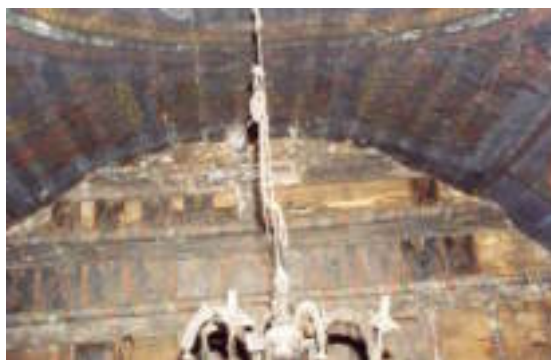
Nave – detail vault