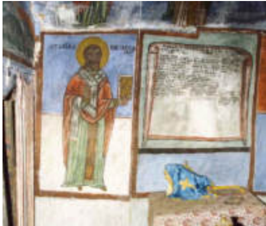
Detail of the Altar – the Northern wall

The wooden church “ Saint Dumitru”, Jupânești commune, Boia village. It was erected in 1760, and the interior painting dates from 1816. The conservation status of the interior painting is very poor. There is an exterior painting in the porch and in the narthex, on the East and West walls, there still exists the original painting coat.