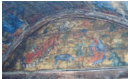
Ensemble of the Nave – West wall