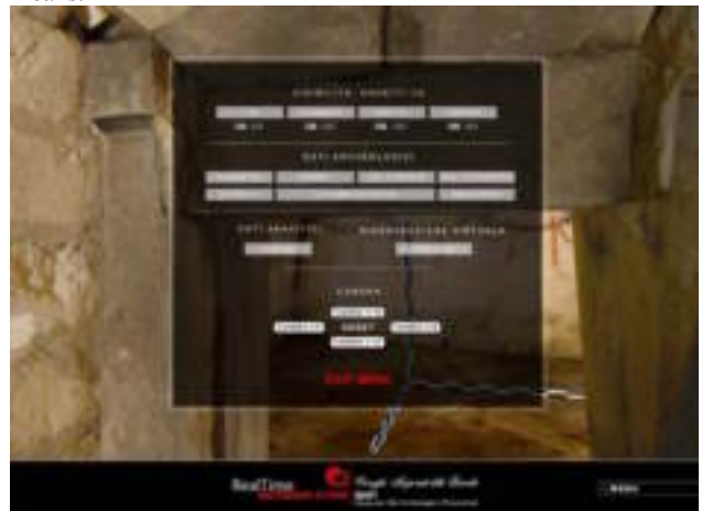
Figure 3. The user interface of RealTime 3D platform