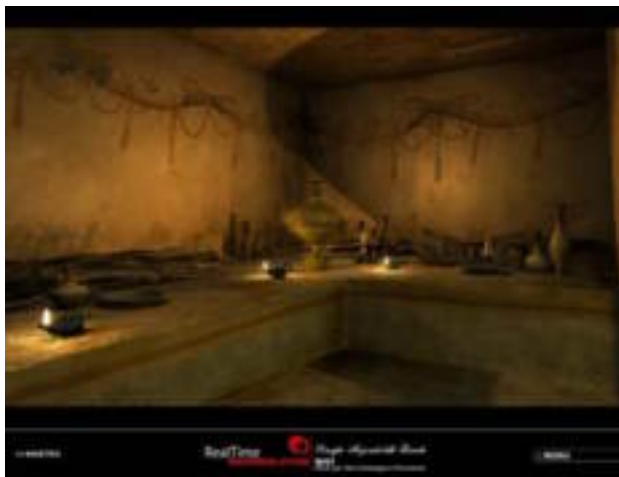
Figure 6. The 3D virtual reconstruction enable the user to make a diachronic reading of the monument

This operation, subsequently repeated at regular intervals, could serve to monitor the state of conservation of the structures. Remember that the three dimensional model, in that it is created on the basis of photographs, is updateable by 'simply' substituting the initial photos with more recent ones. With