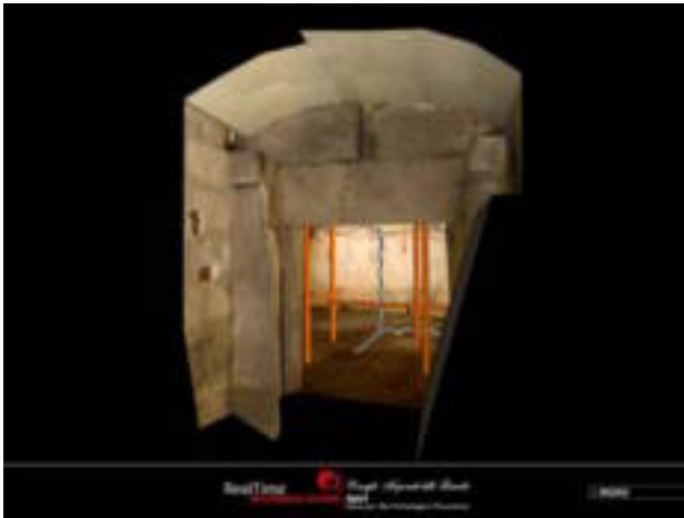
Figure 2. The 3D environment of RealTime platform

location having been forgotten subsequent to their original discovery in 1919 (Dell'Aglio et al. 1990).