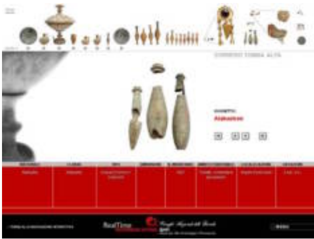
Figure 5. The integrated Data Base to find out about every single find that was made during the excavations

the same time prompts the user to explore the scene in every detail. The QTVR object can, in turn, contain clickable areas, which can activate further links. This then is a journey of discovery with many side roads branching off from the main route, with windows successively opening to provide ever more detailed information on the scientific aspects. Thus conceived, the platform is adaptable for any level of interest and understanding. The user with only a passing interest will find the experience provided by the RealTime navigation sufficient, while those interested in the historic and scientific aspects will want to explore all the sections. There is a specific section, for example, containing the reproduction of the frescoed walls in the form of ortho-photos. The images are produced semi-automatically and are extrapolated from the 3D modelling programme in a phase subsequent to their photo-modelling. For each ortho-photo it is possible to take measurements, but the interesting thing here is that it is possible to call up a representation of the state of conservation of the walls with the relative mapping of the main forms of alteration.