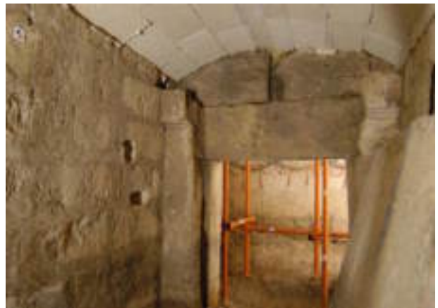
Figure 1. The entrance of a chamber tomb

provides the informational basis for the development of a artistic and cultural interest (F).