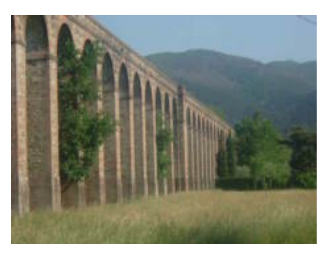
Figure 1. Lucca. Aqueduct. Sequence of arcades.

459 round arches (5,17 m diameter), 460 rectangular plant pillars, in mixed masonry of stones and bricks row, 26 of which, with a cruciform plant, with function of buttress (characterize by numeration, in correspondence of the West sides, two circular