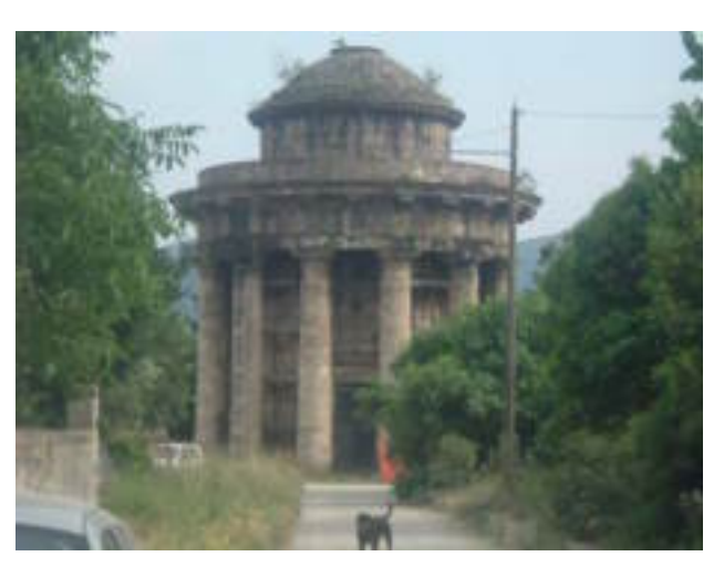
Figure 2. Lucca. Aqueduct. Circulars little temple - cistern.