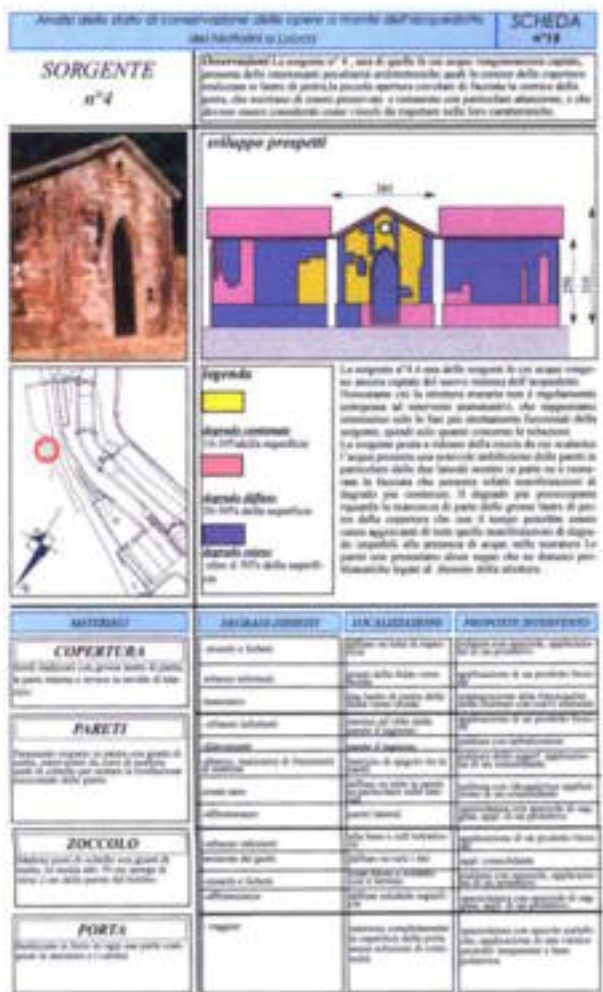
Figure 11. Lucca. Aqueduct. Upstream Works. Analysis of the buildings preservation state.