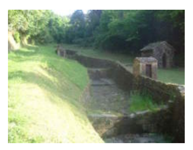
Figure 3. Lucca. Aqueduct. Upstream works. The paving depth of the river San Quirico.