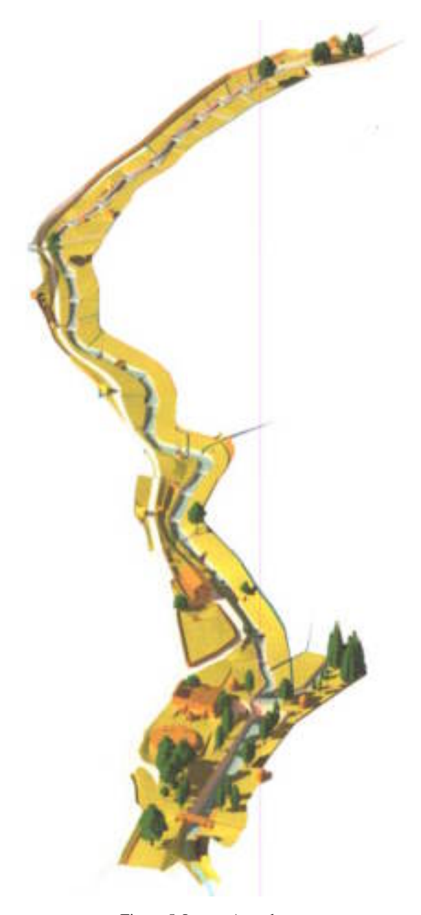
Figure 5. Lucca. Aqueduct. 3D model of the Upstream Works.

On both sides, a series of small neo-gothic buildings characterize and protect the access to the sources.