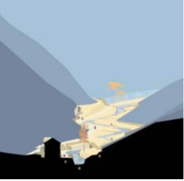
Figure 6, 7. Lucca. Aqueduct. Cross-sections of the 3D model: near the "Serra Vespaiata (top) and near the "Casa del Fontaniere" (bottom).