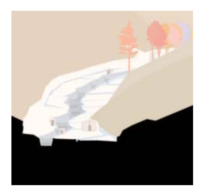
Figure 8. Lucca. Aqueduct. Cross-section of the 3D model near the area of the sources.

approach aiming to revalue the original valencies of a "prescientific" graphic representation and therefore able to direct the attention towards the multidimensional sensations conveyed by the territory. The main problem doesn't consist in fact in the most suitable topographic accuracy, but on the possibility of finding out a kind of representation responding to precision demands as well as to convey the sensations you feel while gazing round or walking in order to express the multidisciplinar peculiarity of one another.