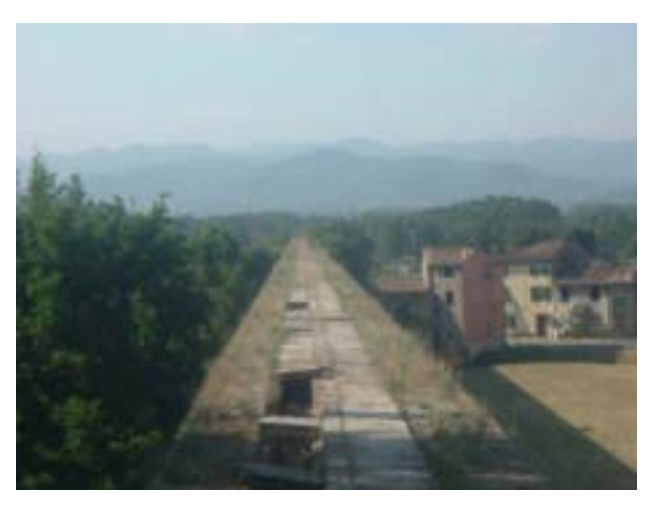
Figure 4. Lucca. Aqueduct. The duct on arcades delimited by two temples.

The cognitive picture of all the components of the mainly aqueduct system and of their preservation state, presents a differentiated phenomenology of decay in correspondence of the extreme poles, with prevailing anthropic damages towards the city, deriving from the railway and the road network and from the process of urban