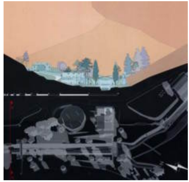
Figure 10. Lucca. Aqueduct. Cross-section of the 3D model near the "Serra Vespaiata".

"Eastern people- Chines, Japanes and Persians - have studied and used such relations for centuries: in the gardens, in painting, in wall decorations, in the carpets (drawing and colours). We must admit our civilisation has still a lot to learn from those people, at least as far as aesthetic harmony is concerned (...). I think it would be good for us if we learnt and took their concepts". (Pietro Porcinai).