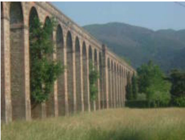
Figure 1. Lucca. Aqueduct. Sequence of arcades.

459 round arches (5,17 m diameter), 460 rectangular plant pillars, in mixed masonry of stones and bricks row, 26 of which, with a cruciform plant, with function of buttress (characterize by numeration, in correspondence of the West sides, two circular