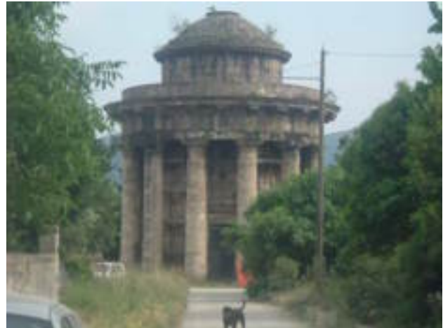
Figure 2. Lucca. Aqueduct. Circulars little temple - cistern.