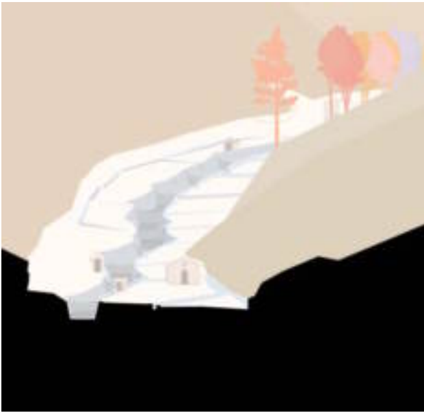
Figure 8. Lucca. Aqueduct.

Cross-section of the 3D model near the area of the sources.