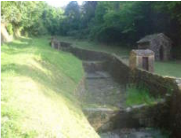
Figure 3. Lucca. Aqueduct. Upstream works. The paving depth of the river San Quirico.