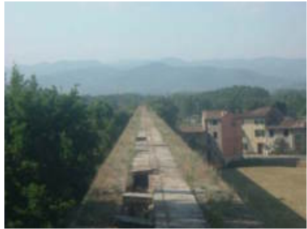
Figure 4. Lucca. Aqueduct. The duct on arcades delimited by two temples.