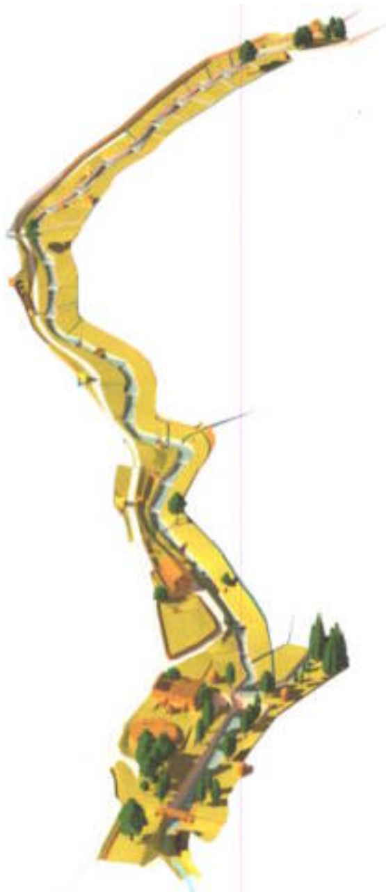
Figure 5. Lucca. Aqueduct. 3D model of the Upstream Works.

On both sides, a series of small neo-gothic buildings characterize and protect the access to the sources.