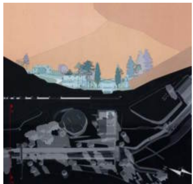
Figure 10. Lucca. Aqueduct. Cross-section of the 3D model near the “Serra Vespaiaata”.

“Eastern people- Chines, Japanes and Persians - have studied and used such relations for centuries: in the gardens, in painting, in wall decorations, in the carpets (drawing and colours). We must admit our civilisation has still a lot to learn from those people, at least as far as aesthetic harmony is concerned (...). I think it would be good for us if we learnt and took their concepts”. (Pietro Porcinai).