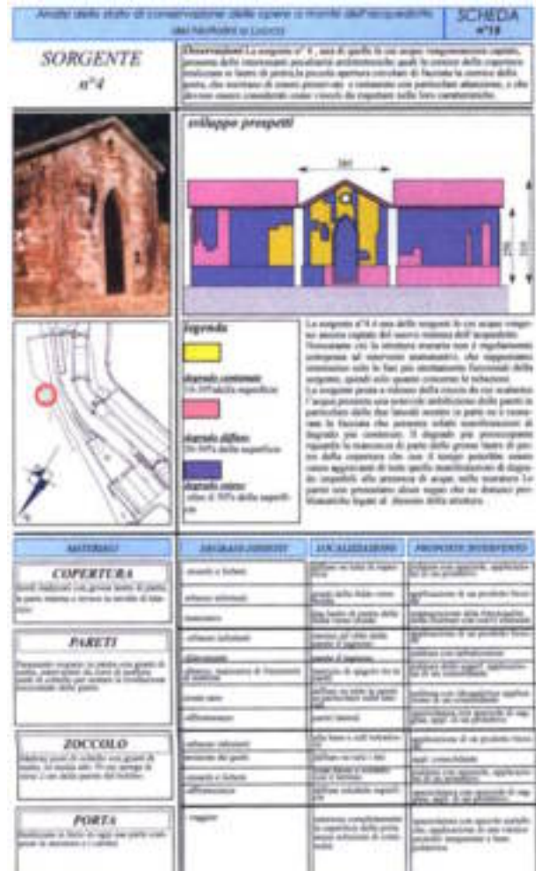
Figure 11. Lucca. Aqueduct. Upstream Works. Analysis of the buildings preservation state.