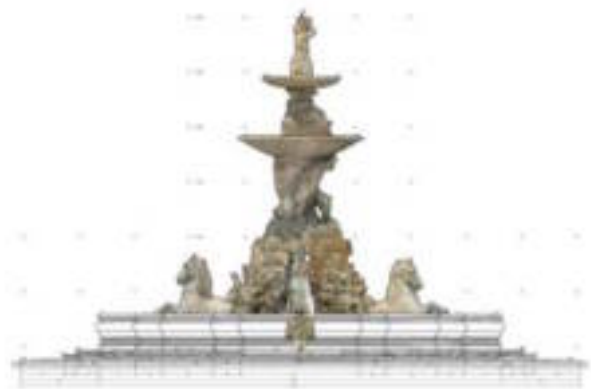
Figure 3. Residenzfountain in Salzburg with 2.700 scans

The object was measured with a topometric close range scanner. Topometric metrologies are based on the principle of optical triangulation by means of structured illumination: A pattern of well defined periodic fringes is projected onto the object, recorded by a high resolution camera and transferred to a powerful imageprocessing system for data analysis. At the end you get a 3D model of the surface. Further the model has been textured. The 3D-sensors of these systems are based on the patented Miniature Projection Technique (MPT), combining Phaseshift- and GrayCode-method, which guarantees high accuracy of data. About 2700 single shots of the fountain have been taken and at the end they have been processed and merged to one model with a deviation of 0,5 mm at every point. The complete model consists of about 26 Mio. triangles and the texture was created of about 200 digital pictures.