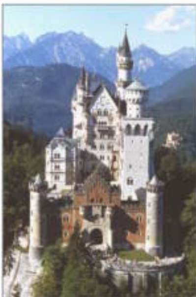
Figure 2. Photo Neuschwanstein Castle / Germany