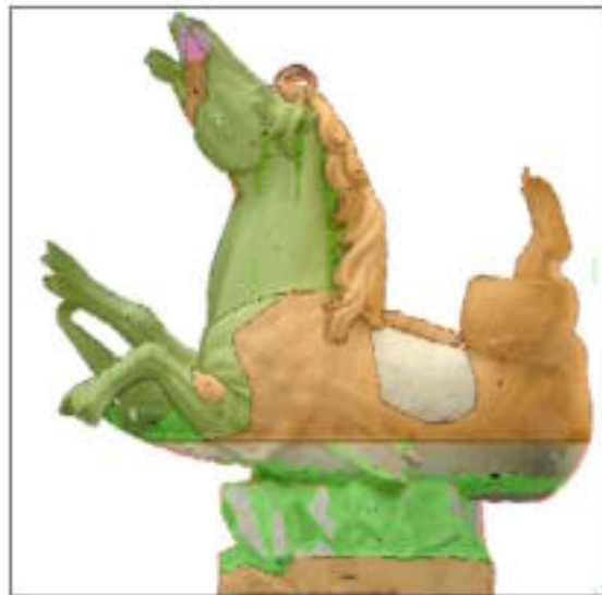
Figure 5. 3D model and stone determination