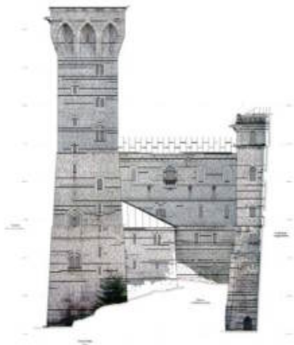
Figure 1. Orthophoto Neuschwanstein Castle / Germany