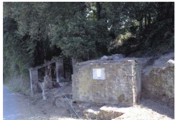
Figure 1. The fountain before reconstruction

In Summer 2002, volunteers of the S.C.I. started work on the restoration of the fountain, filling 12 small lorries with mud and detritus, and consuming a dozen metal brushes used for cleaning recuperated old stones to be re-used.