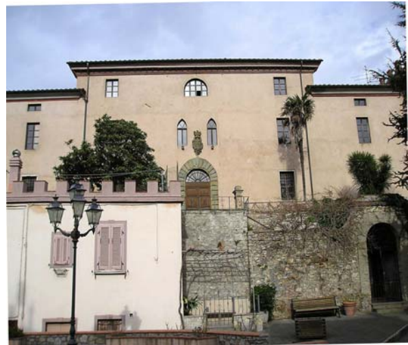
Figure 4. The front of Palazzo Montalvo

On the rear, on the East side of the building, there is an enclosed courtyard, which looks out on the Church Square, where the Church of Sant’ Andrea stands.