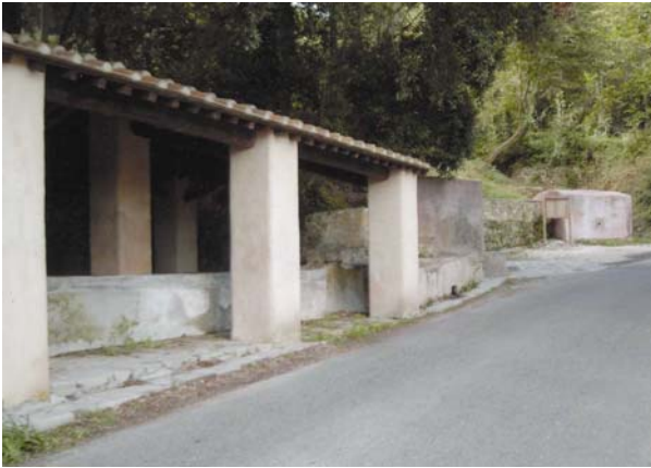
Figure 2. Reconstructed Fountain

In 2004, having received more financial aid, many days of voluntary work were donated by local people on the paving zone, on the preparation of a picnic and parking area, including the creation of flower beds. This completed the fountain project.