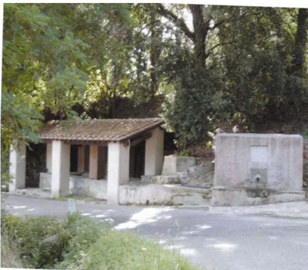
Figure 3. The Fountain before the inauguration

On December the 8 th 2004, Fonte Carpoli was inaugurated; the mayor unveiled the epigraph affixed on the reservoir, dedicated to all the volunteers involved in the project: