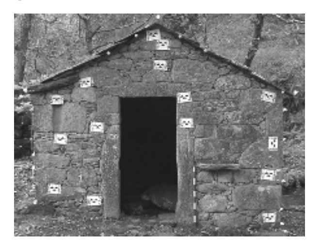
Figure 2. Facade targets and arris targets

To Determine the accuracy of the twenty seven methods we must measure with the same construction points one by one. They will be also measured with the reference equipment, total station, to calculate the errors in each equipment and in easch point. With that purpose a set of points are marked on the facade. Those will be located with the photogrammetric software by measn of the facade targets. The arris targets are used to create the constructioon wireframe. Every points, facade points and arris points are used for the spatial orientation of the 3-D model.