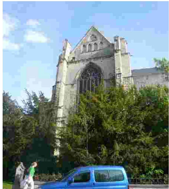
Figure 3: St-Jacobs Church

The St-Jacobs Church is located in Leuven, which is famous for its University. The "Katholieke Universiteit Leuven" (K.U.Leuven) was founded in 1425.