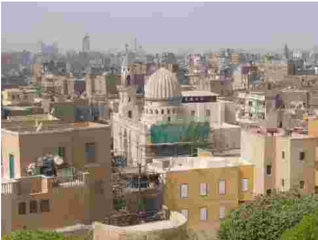
Figure 2: Aslam al-Silahdar Mosque and Islamic Cairo

The Aslam al-Silahdar Mosque is located in the heart of Islamic Cairo, Egypt, in one of the historically important quarters of Cairo.