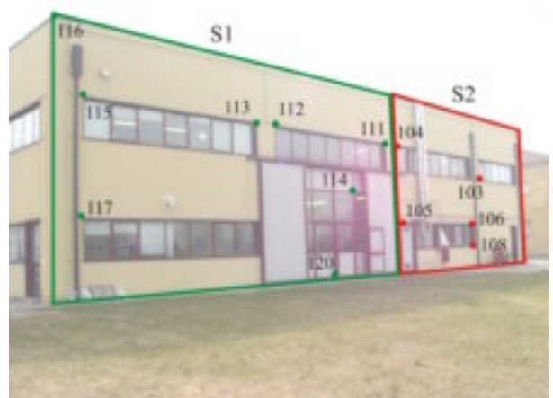
Figure 2. The scanned areas on the front of the building.

The above described procedure was applied to a very simple case. The front of a building, figure 2, was divided into two parts, each one of them was supposed to be scanned independently.