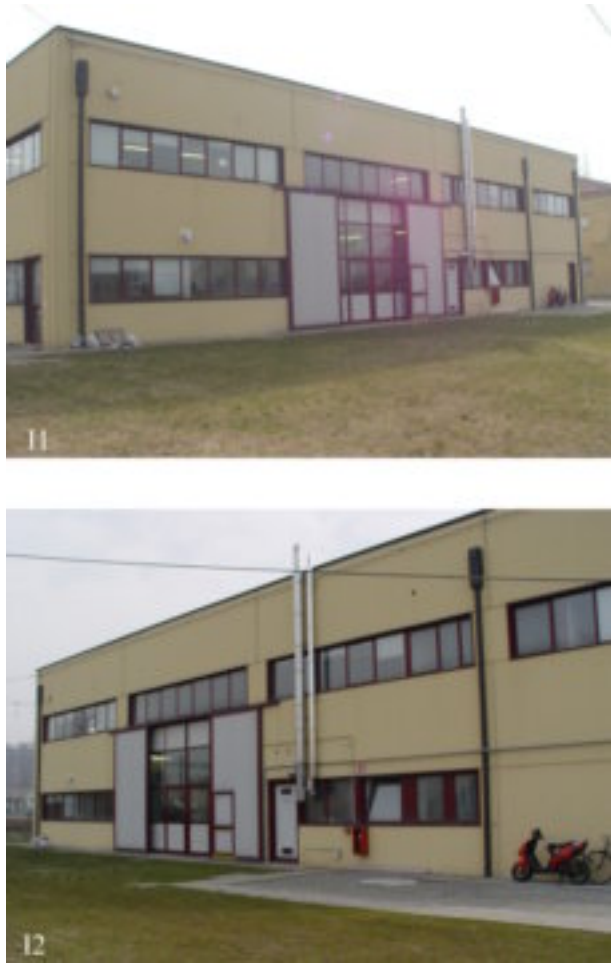
Figure 3. Digital images I1 and I2.

Two digital images of the whole facade were taken with a camera Sony DSCF717 (figure 3).