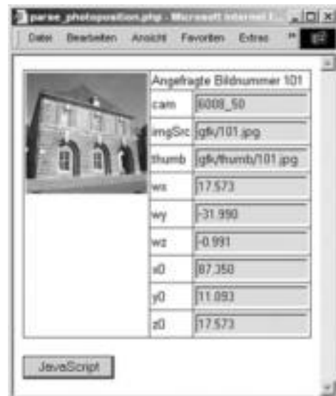
Figure 3. Parsing XML-Information and displaying the result on a Web page

Scalable Vector Graphics SVG is the XML formulation of 2D vector graphics. It includes drawing of vector data, displaying of image data, interaction and animation. Structure and appearance of graphic elements is separated by using style sheets.