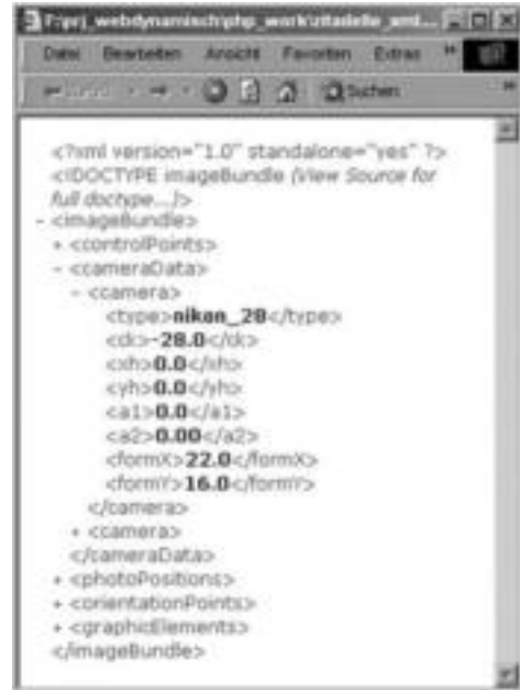
Figure 2. Tree structure of a XML document

<xsl:for-each select="the search pattern"> <tr> <td class="tab_value"> <xsl:value-of select="type"/> </td> </tr> </xsl:for-each>