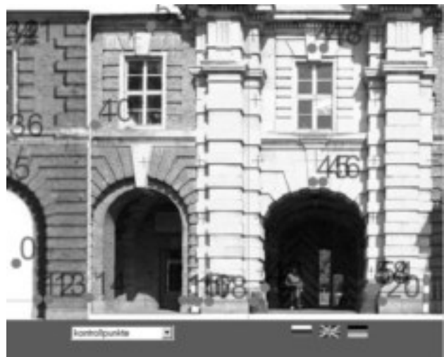
Figure 4. Image data and vector data combined with SVG

Applying a SVG viewer as a plug-in for the Web browser enables zooming and panning in the graphic area. Figure 4 displays the position of control points and demonstrates the use of image data inside vector data.