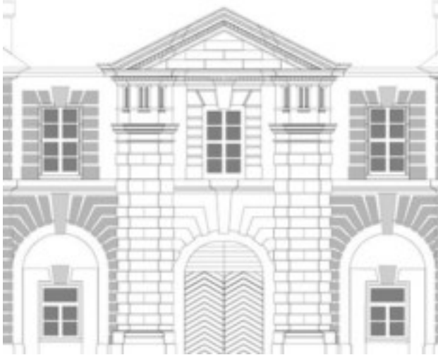
Figure 5. Appearance of a SVG file is driven by a style sheet

SVG enables among other features interactivity and animation. The photogrammetric application benefits from interactivity. Registered camera positions are marked in the xy-drawing using symbols. Those symbols carry a link to an evaluation software, that has access to the image data.