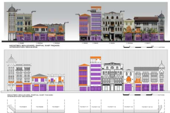
Figure 6. Comparison of the thematic representation of intervention decisions with 2D thematic drawing

Comparison of the rectified image mosaic with 2D elevation proved that the visual information comprehended in the mosaic is realistic data. The architectural details, materials, colors and textures are presented in rectified image mosaic while 2D elevation has an abstract description. The thematic information illustrated on the rectified image mosaic gives way to the better perception of the themes (Figure 6). At the same time, the timeline of the streetscape can also be better understood with the realistic media that is produced.