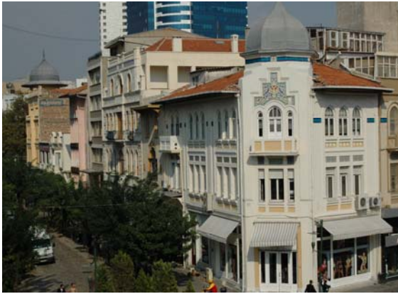
Figure 2. Necatibey Boulevard as viewed from Mimar Kemalettin Street

Today, the selected streetscape and its surrounding consist of commercial buildings dating 1920s, which represent the architectural characteristics of Early Turkish Republican period, and then 1950s onwards (Figure 2). Especially the ones constructed in 1920s are valuable with their architectural characteristics; however, some alterations and conversions are identified on the façades because of the unconscious usage and the change of the lifestyles.