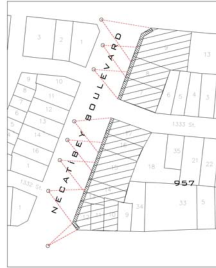
Figure 3. Station points used during tacheometric measurements

during tacheometric works: Electronic tacheometer should be set up in appropriate position according to façade planes. To have an accurate result, minimum 4 control points for each photograph of a single plane must be measured. Natural points such as a window corner or end of a crack or corner of a casing can be used as control points. Special importance should be given for homogenous distribution of these control points. The surveying network should be adjusted in order to create a local reference system (Figure 3).