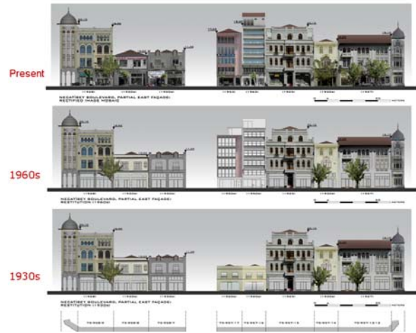
Figure 5. The timeline of the streetscape

These historical reconstructions show that the buildings constructed in 1920s and at the beginning of 1930s are mostly two or three storied ones representing the characteristics of First Nationalist Architectural Style. In 1950s and 1960s, the ones in lots numbered 16 and 17 in block numbered 957 were demolished and modern multi-storey ones were constructed in these lots. It can be said that the element alterations mentioned before have taken place after 1960s in the recent years.