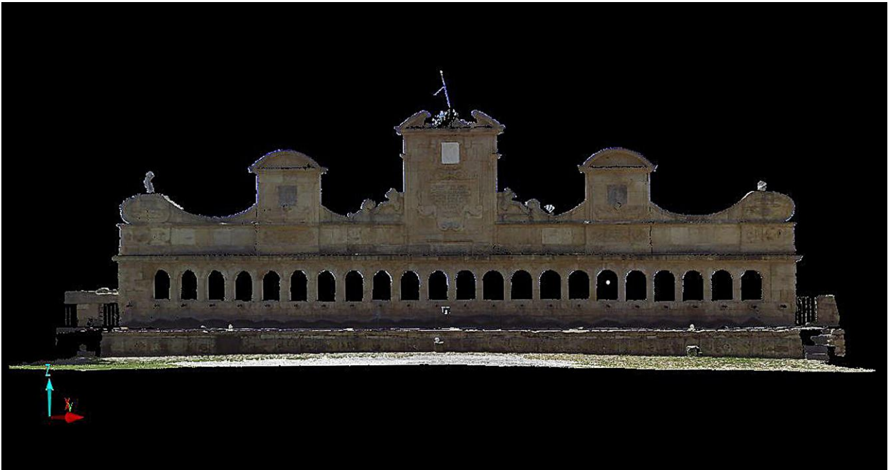
Figure 5: Ortophoto of the Granfonte in Leonforte

historical and aesthetic nature, but also supported by those intuitive and perceptive values that are stimulated only by on-site observation.