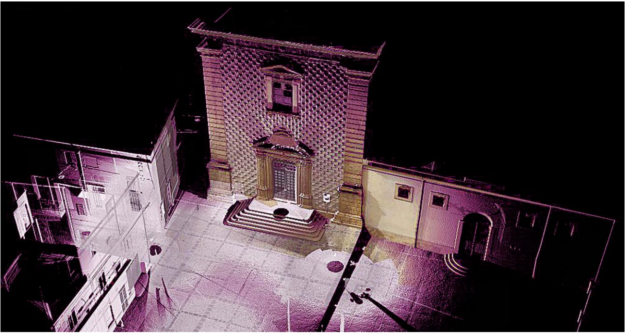
Figure 3: Aidone – the Church and former convent of San Domenico