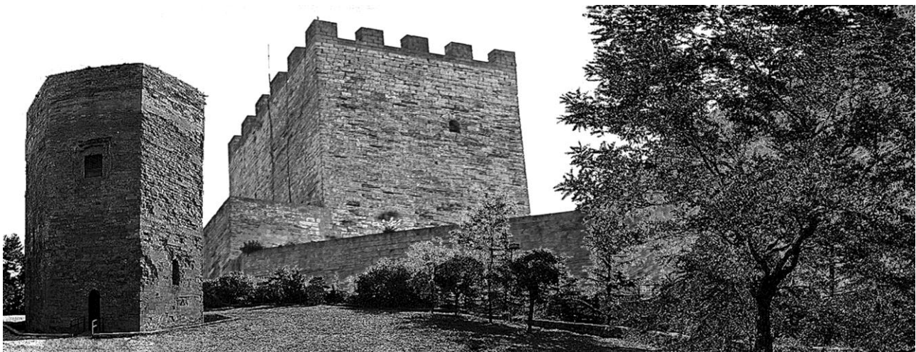
Figure 2: Enna – from the Tower of Frederick II to the Castle of Lombardy

On the heights facing Enna stands the town of Calascibetta; burial grounds dating from the 9 th to the 5 th century B.C. show that this area has been inhabited since ancient times. The town was later built by the Arabs, who named it Kalathos-Scibeth , and then expanded by Count Roger in 1062. To the southeast lies the Arab-Norman town of Aidone, nicknamed “the balcony of Sicily” for its views and featuring the 16 th century Church and former convent of San Domenico with its diamond-pointed rusticated façade (Fig. 3); then to the southwest, is the city of Pietraperzia which, according to some, was the site of ancient Caulonia. Its present town centre was established in medieval times around an Arab fortress that was subsequently restored by the Normans. The centre also contains the Cathedral Church, built in 1308 and rebuilt almost completely, in a larger and lavish form, around the year 1500 (Fig. 4). Leonforte lies to the north of Enna.