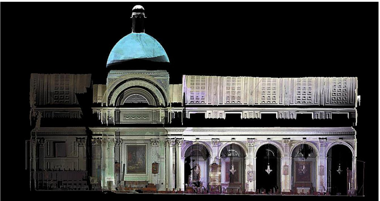
Figure 4: The Cathedral of Pietraperzia – longitudinal cross section

Founded in 1610 by Branciforte family, it is dominated by their outstanding Palazzo and by the Granfonte , the monumental fountain built in 1652 (Fig. 5). Historical documentation and research concerning these monuments, in terms of both graphics and critical analysis, are unreliable, except for the work produced by Walter Leopold, a young Italian-German engineer who came to Sicily in 1910-11 to study the medieval architecture of the Sicilian interior, including Enna [3]. Although impressed by the accuracy of this study and even inspired by the excellent results achieved by contemporary artists, we decided not to follow in the footsteps of our predecessors. Conscious of the fundamental importance of surveying in the preparation of restoration and conservation projects, we based our work on a close integration between traditional and innovative tools and methodologies, developing an approach based not only on logical processes of a