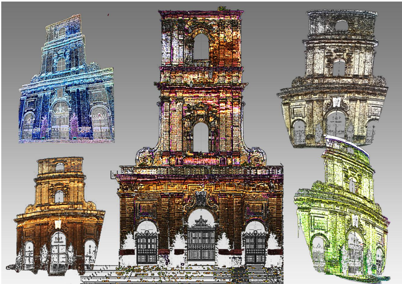
Figure 6: The Duomo of Enna – mapped point clouds

Finally, in attempting to implement new forms of representation of the decay and deterioration of material surfaces, our scans have also been “clothed” by drawings mapping the decay of buildings, elaborated by the students of the Architectural Restoration Workshop (a.y. 2009-2010) of the Faculty of Engineering and Architecture of the “KORE” University of Enna, Italy (Fig. 6).